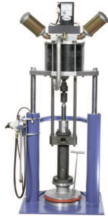
Standard 20 liter (5 gallon) Unloader

EFD reserves the right to make design changes to products to improve their function.