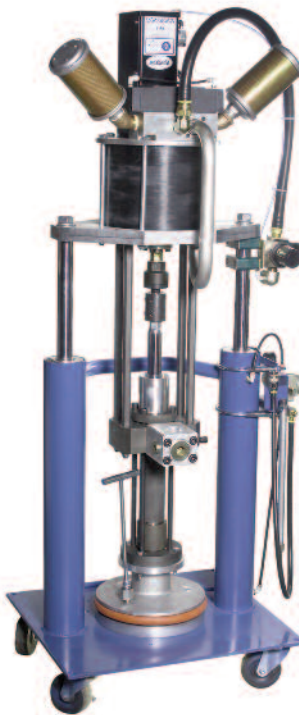
20 liter (5 gallon) Bulk Unloader